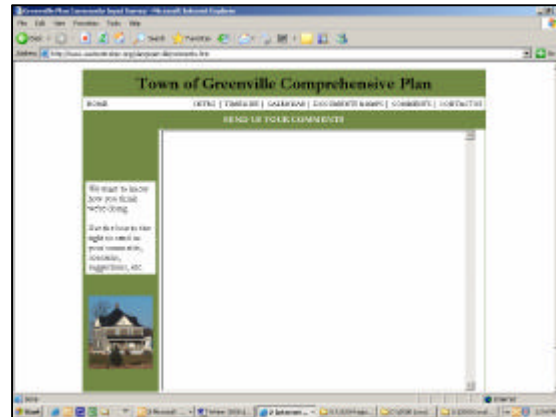
The project website can be used to learn more about the Comprehensive Plan’s planning process, and to discover a variety of ways to participate and/or provide input. The “Comments” box, illustrated above, is just one example.

All community members are encouraged to get involved and provide input throughout the entire planning process. If you would like to receive emails to stay updated on the progress of the comprehensive plan, please provide your email via one of the means listed above.