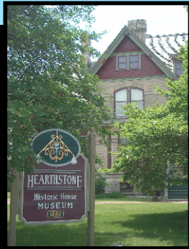
Hearshstone - World's First Hydro Electric House, City of Appleton