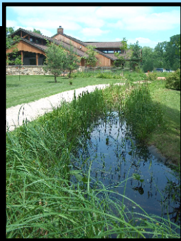
Heckrott Wetland Reserve, City of Menasha