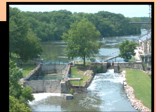
Lock No. 1, City of Appleton