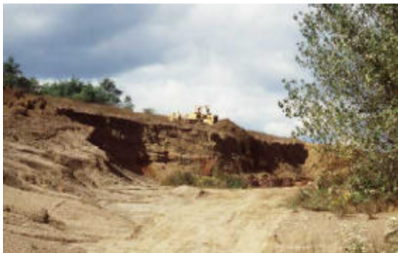
Figure 1. Sequence of reclamation of an unstable highwall composed of unconsolidated material to a stable slope as part of the productive post-mining land use.

deformability (i.e., through uniaxial-compressive testing), but these testing protocols often require specialized equipment and training and are beyond the capabilities of most operators. This sort of specific, specialized testing should be required only in instances where the potential for significant damage from a slope failure (i.e., there is a building proposed at the base of the highwall) is high.