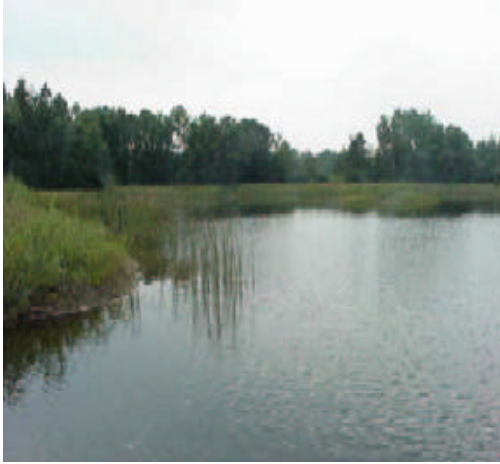
Figure 3. Two equally valid but contrasting posting-mining land uses, which demonstrate how highwall reclamation can vary from wildlife habitat to a public park.